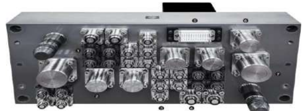
900kN Blow Molding Machine