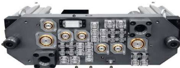
900kN Blow Molding Machine