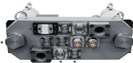
5,000kN Die Casting Machines