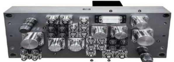
900kN Blow Molding Machine