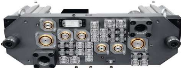
900kN Blow Molding Machine