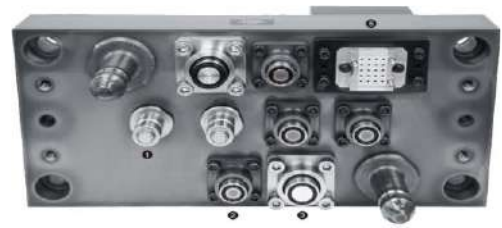
5,000kN Die Casting Machines