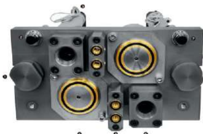
12,000kN Hot Press