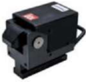
Dust proof cover + heat proof sealing + grip handle