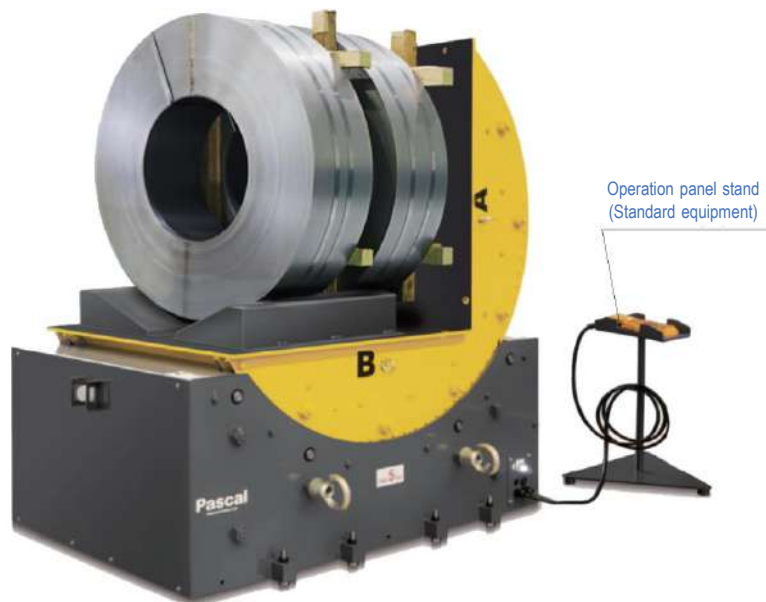
Operation panel stand (Standard equipment)