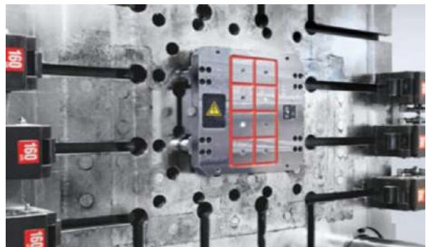
8,500kN (850ton) Mesin Die-casting plat-C klem magnet & Klem hidrolik TYB