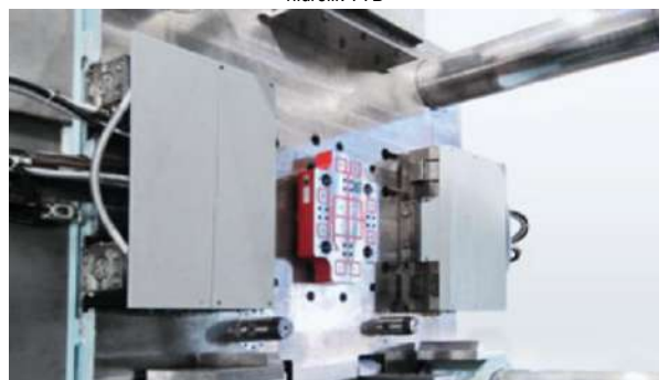
16,500kN (1,650ton) Mesin Die-casting plat-C klem magnet