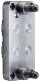
Sisi (soket) mold