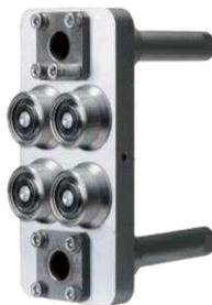
Sisi (steker) mesin